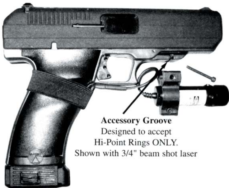
Accessory Groove Designed to accept Hi-Point Rings ONLY. Shown with 3/4" beam shot laser